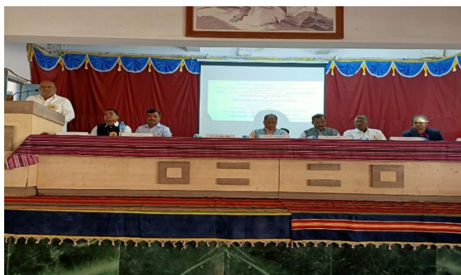
Addressed by Hon. J. K. (Bapu) Jadhav