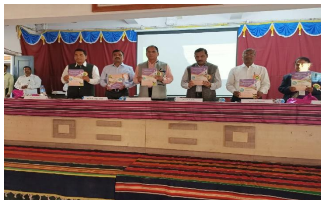
Publication of Seminar Proceeding