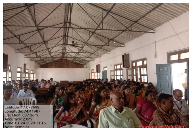
Participants of the Seminar